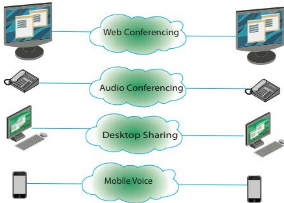
(a) Collaboration alternatives prior to unified communications